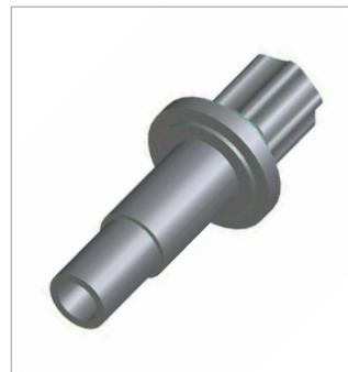
▲ Area of application